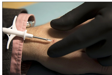
Figure 3: The Independent reports that Swedish workers were implanted with microchips – the size of one grain of rice – to replace cash cards and ID passes. Microchips are injected in between the thumb and index figure with a syringe ( The Independent , 6 April, 2017)

is being written, this microchip has already begun to be implanted into the human hand and has proven its usefulness for many kinds of digital economic transactions; see the picture below).