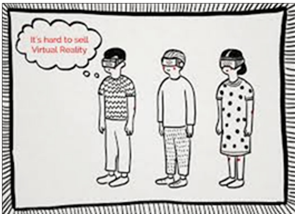
Figure 1: “ It’s hard to sell Virtual Reality ”, (Picture taken from LinkedIn.com, downloaded on March 12, 2019)

can be widened with more questions, such as: when was the last time you went to an art exhibition and underwent the experience as if you were dragged into the inner world of its painter's imagination? Or when you had the feeling that you were playing on the stage along with your favorite band?