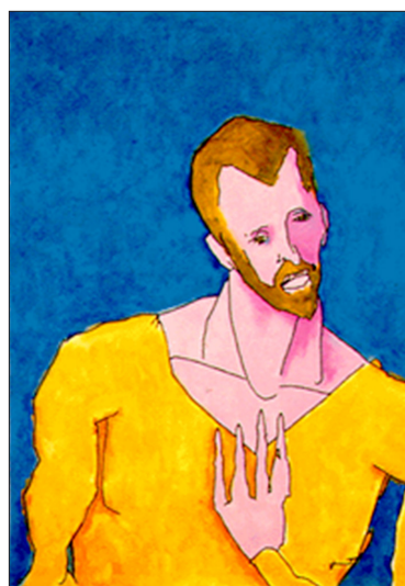
Figure 5: Theo , 1992. Dilukis oleh AARON, cat di atas kanvas, 34x24 inchi.

An example of a painting produced by a computer can be found in a program called AARON created by Harold Cohen, a professional painter who was interested in Artificial Intelligence (AI) present in computers. Cohen created the AARON in 1972. As a program, the AARON was intended to create pictorial images. It was meant not for copying images, or changing any given input image, but for continuously creating new images. The AARON controls a robot machine, which at the first stage produces lines of painting in monochrome (black and white), after which Cohen finishes the painting by putting in various colors manually. Despite the presence of the artist’s manual activity, the development of the AARON has made it possible to paint with many colors, sizes, as well as to wash the brushes used for adding color to the drawing.