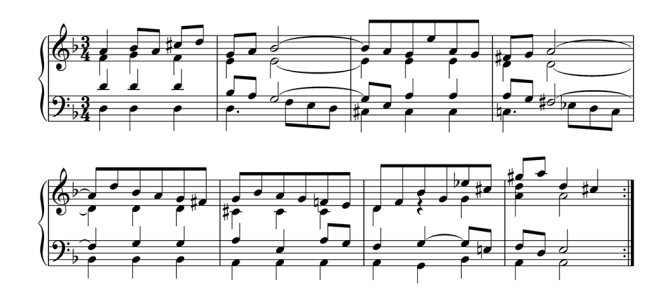
Example No. 7 J. S. Bach. French Suite No. 1 in D minor . Sarabande

with the stratification of its instrumental parts into divisi sections in each of the lines of the two-line clavier notation.