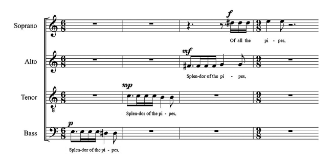
Example 5 The begging of Sofia Gubaidulina's Interlude (Movement 4)

In contrast to the previous movement, in this movement this study discovers a responsive type of psalmody, with calls and responses between the soloist and